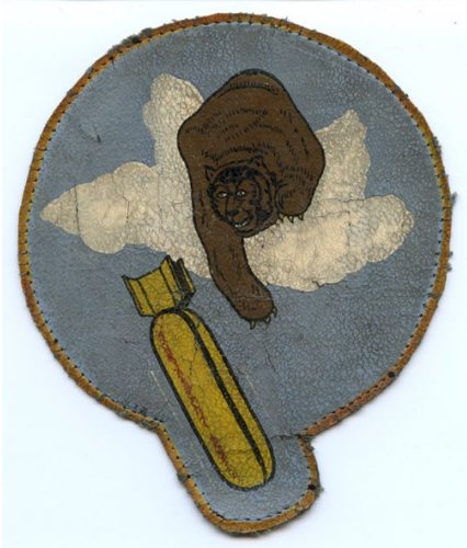
569 Bombardment Squadron emblem